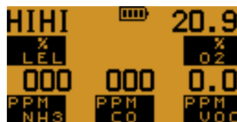
Display in alarm conditions